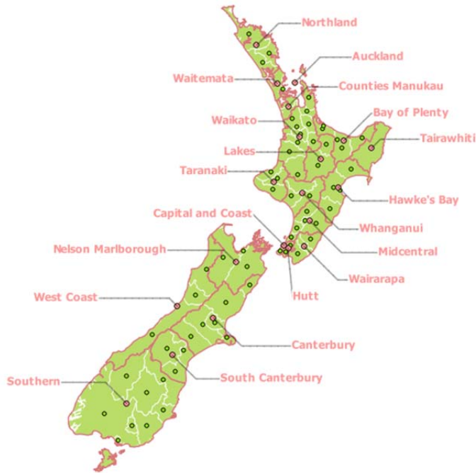
Figure 4 Map of combined District Council and District Health Board boundaries